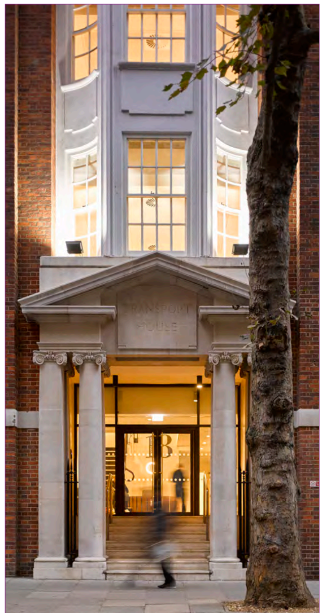
LGA offices, 18 Smith Square

Your 2018/19 subscription gives you membership of both the new LGA and the current unincorporated Association until the General Assembly takes the formal decision to disband it.