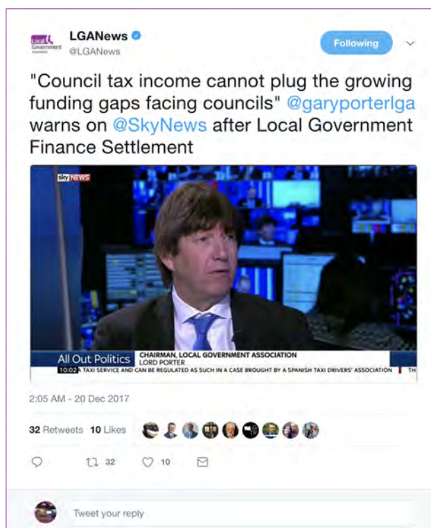
Media coverage for the Provisional Local Government Finance Settlement

We support councils to drive innovation and improvement, sharing best practice across the sector and helping them to improve services and deliver millions of pounds of savings.