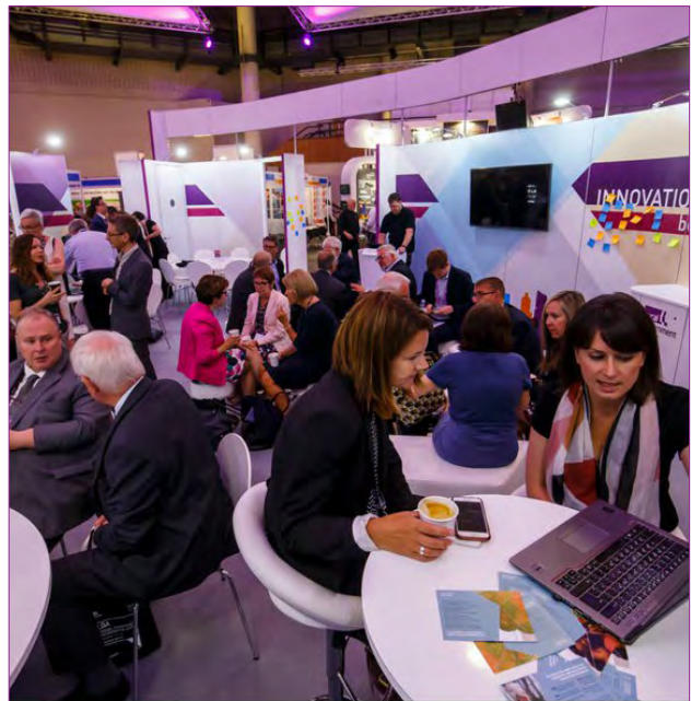
Innovation Zone, Annual Conference

For an up to date programme of events, visit www.local.gov.uk/events