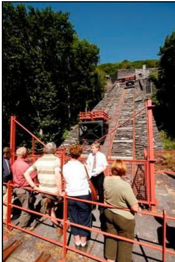
A guided walk at National Slate Museum

Research and advice will be provided, in conjunction with members of the working party, on the possibility of linking this development with the enhancement of Amgueddfa Cymru's existing network of subject-specific history museums located within EEC Convergence Funding areas.