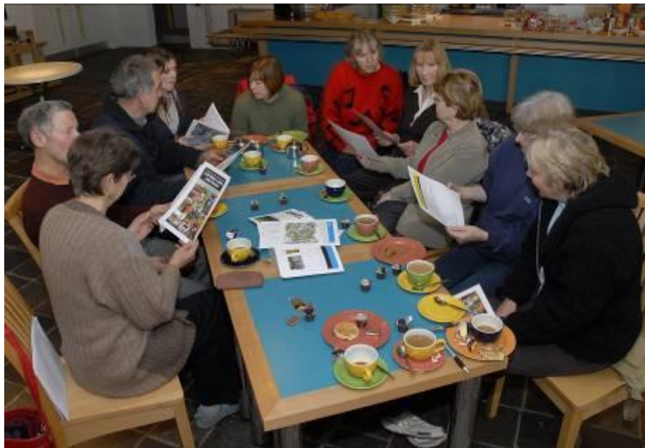
Welsh for Adults at National Wool Museum

At National Museum Cardiff, Taith Iaith (talks for Welsh learners and speakers) will be delivered on Origins and Artes Mundi .