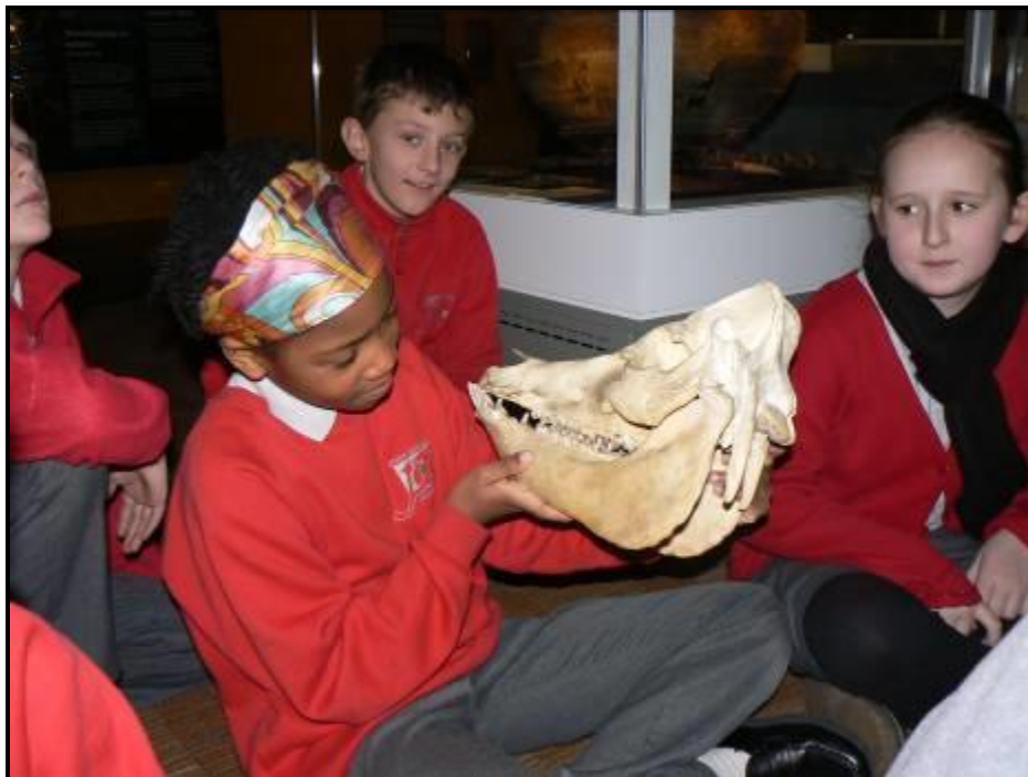
Schools workshops in Origins

The Archaeology Learning Officer has developed learning opportunities for teachers, in relation to Origins at National Museum Cardiff, in collaboration with Careers Wales/Education Business Partnerships and General Teaching Council Wales Network. A teacher from Machen School was seconded to the Learning Department, using General Teaching Council Wales funding, for a 6 week period to devise opportunities for schools to engage with Origins .