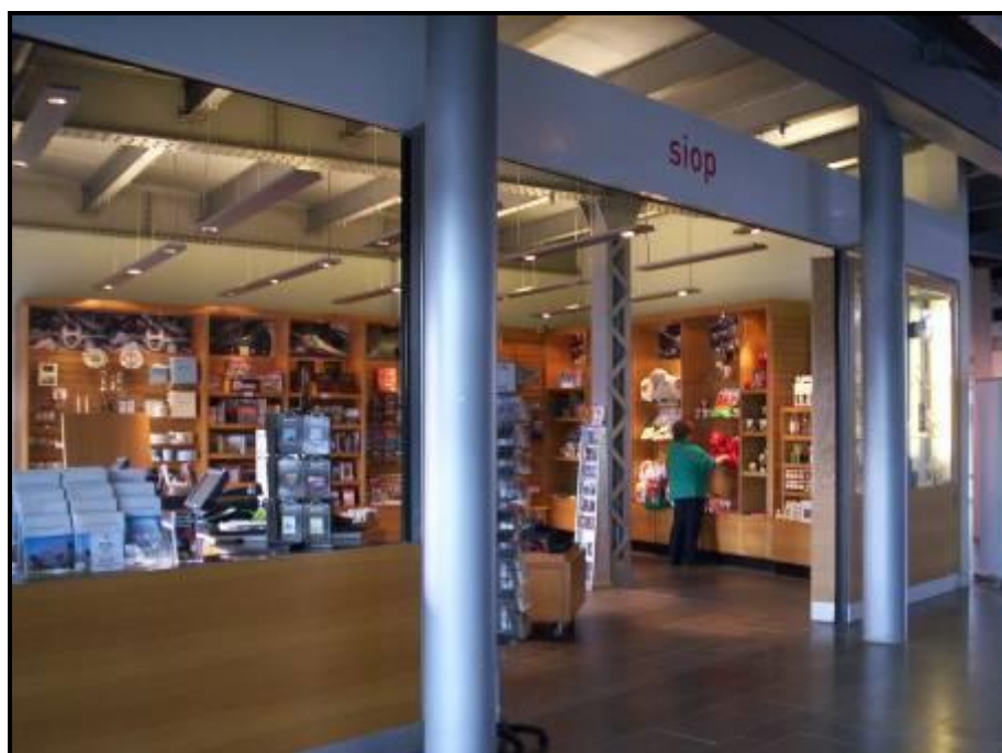
New shop at National Waterfront Museum Swansea