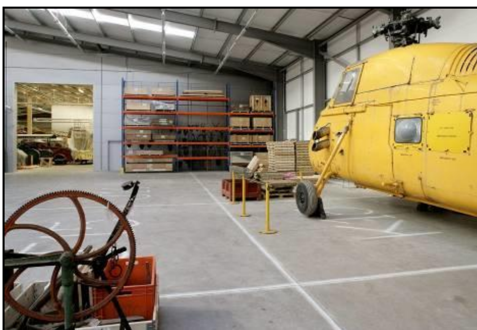
National Collections Centre, Nantgarw

The National Collections Centre has been reorganised to provide a dedicated Visitor Study Room and meeting room, which has improved access to the collections and archives. The move of industrial textile machinery from an off-site store to National Collections Centre is now complete and it is anticipated that agreement will finally be reached this month on adopting a sustainable solution for the operation of the environmental control systems.