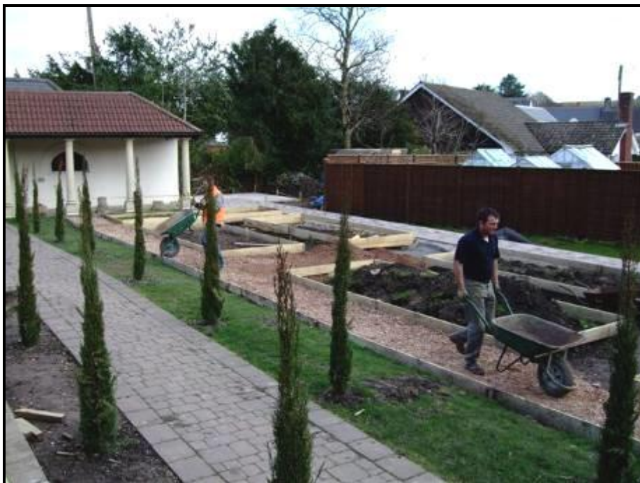
Roman Garden at National Roman Legion Museum

Definition of terms of a maintenance contract for digital displays at National Waterfront Museum Swansea is in progress and the vacant Technical Officer position has been filled with two part-time posts, increasing the flexibility and skills of the Museum's Technical Team