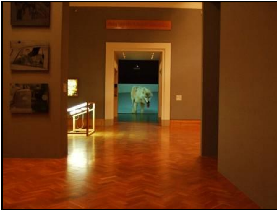
Artes Mundi 3 , National Museum Cardiff

Journals opened on 15 December 2007 in Oriel 1 at St Fagans: National History Museum and continues to 6 April 2008.