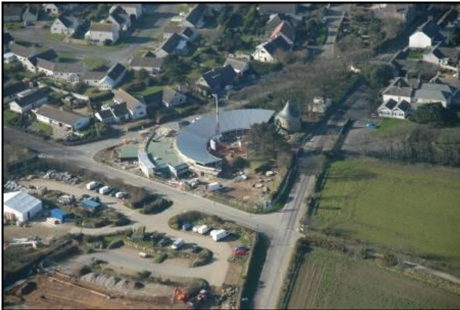
Oriel Parc: Pembrokeshire Landscape Gallery seen from the air

Work progresses on the completion of Oriel Parc: Pembrokeshire Landscape Gallery .