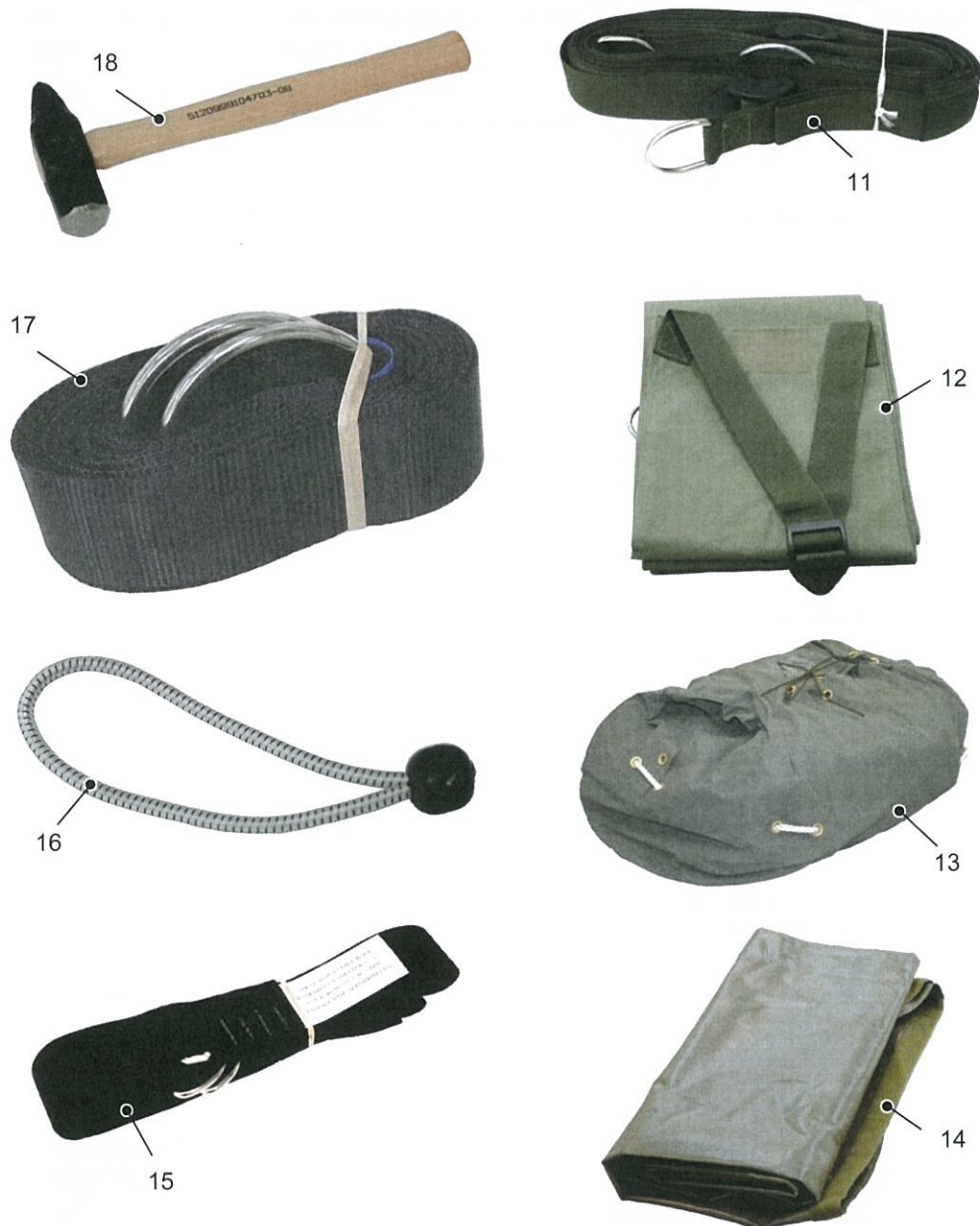
Fig 2 Shelter, Operational Field Catering System (OFCS) 3.6 M X 3.6 M (12 FT X 12 FT)