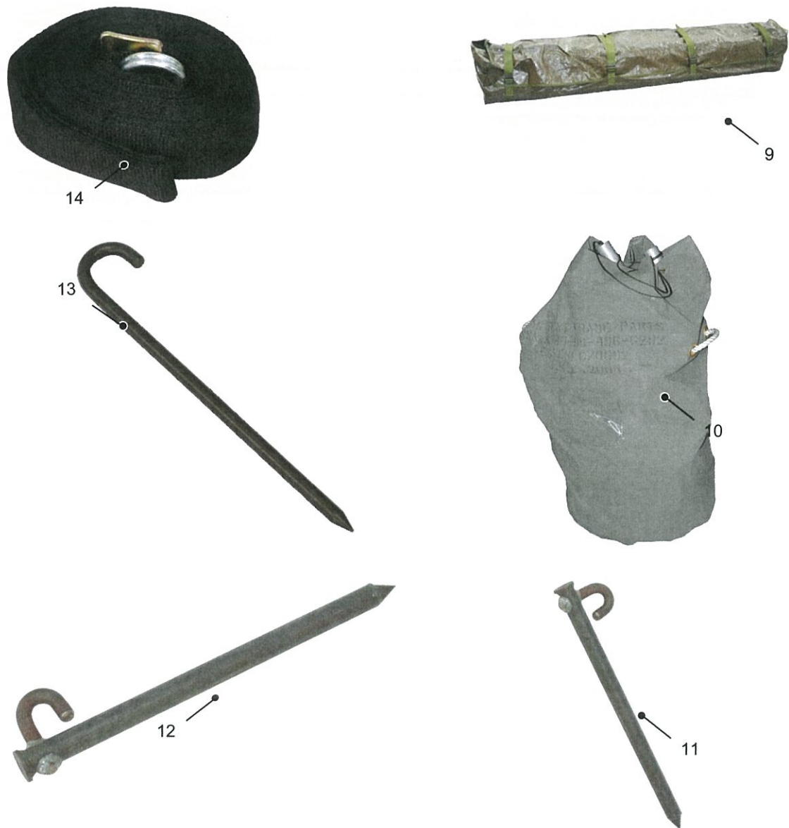
Fig 1-2 Shelter, passageway 3.6 m x 1.8 m (12 ft x 6 ft)