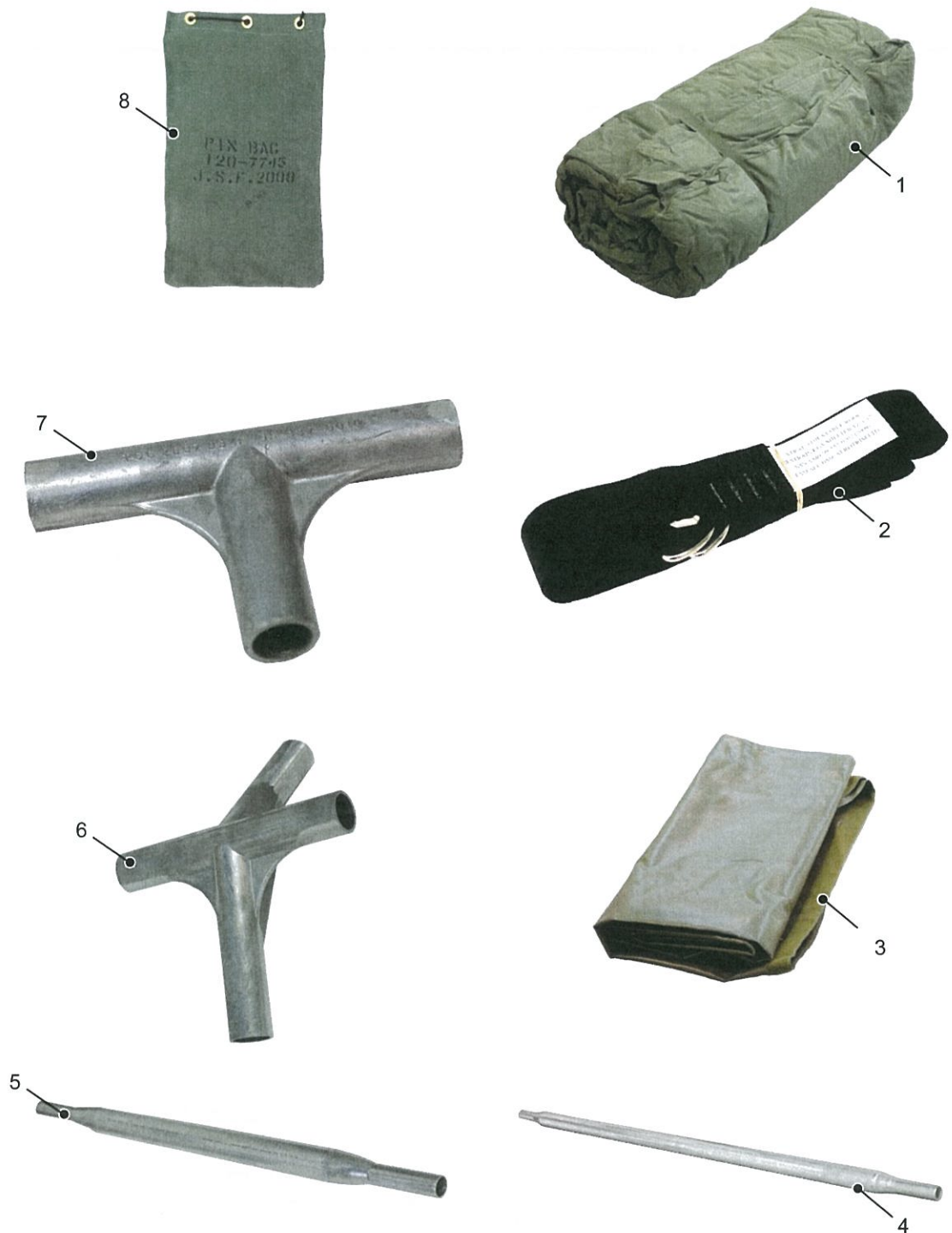
Fig 1-1 Shelter, passageway 3.6 m x 1.8 m (12 ft x 6 ft)