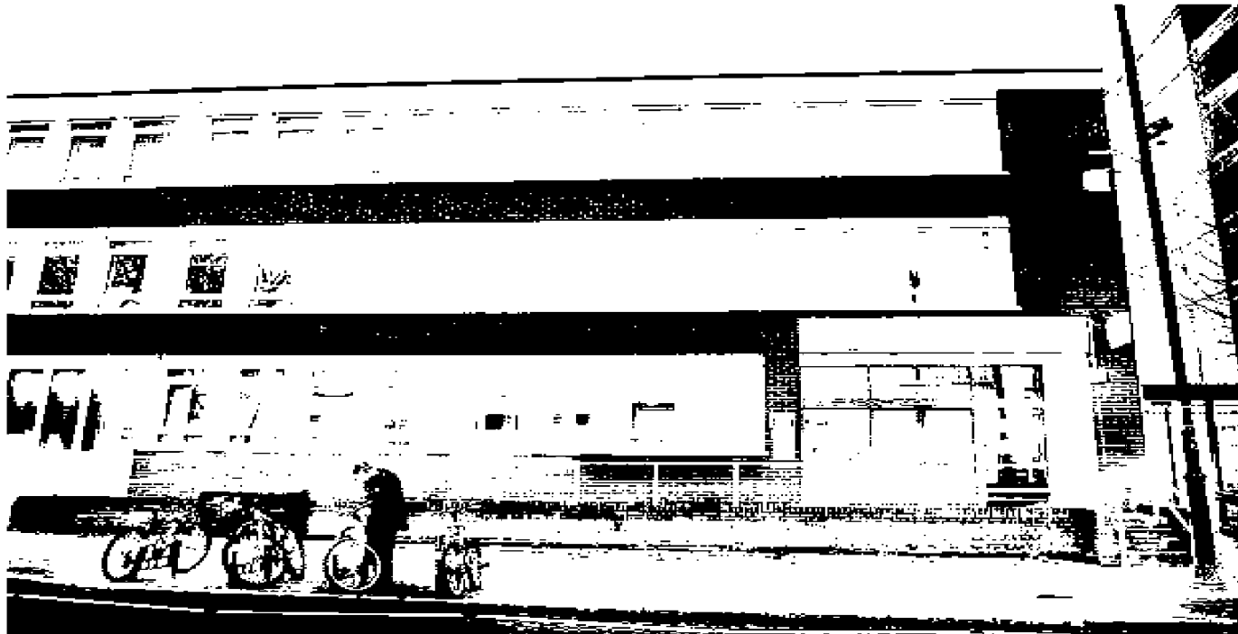
Birkenhead Job Centre, where interviews took place

A Merseyside job centre was used by a businessman offering £34,000-a-year jobs that