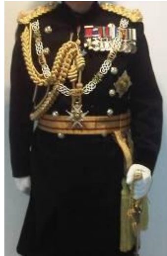
Fig 2. No 1 Dress and No 3 Dress