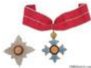
Neck decoration and breast star of

13.033 Full Dress, Nos 1 and 3 Dress. The riband of miniature width, with the badge attached, is worn round the neck, inside and under the collar of the jacket or tunic, so that the badge hangs outside with about 19 mm of riband showing below the collar. A Knight Commander, if in possession of badges of more than one Order, is to wear the badge of the highest grade as indicated above. The remainder are to be worn according to grade, one below the other, beginning about 25.5 mm below the senior badge, each suspended from a riband tunic slip emerging about 19 mm below the buttons of the tunic. A small eye is stitched inside the garment, to which the riband is to be fastened by a hook. In uniform, full size neck badges only are to be worn round the neck; any which on account of their number cannot be so worn are not to be worn on the breast with other Decorations and Medals. Stars are to be worn on the left breast in the same manner as for Full Dress, Nos 1 and 3 Dress.