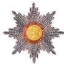
Breast Star for

The badge of the First Class is never to be worn round the neck as a neck Decoration when in uniform. The riband is to be worn under the shoulder strap, aiguillette and waist belt or sash. The bow from which the badge is suspended is to rest on the hip immediately below the belt or sash. Stars are worn on the left breast. When 2 stars are worn the senior star is placed directly above the other. When 3 stars are worn they are placed triangularly and when 4 stars are worn they are placed in a diamond formation; in each case the senior star is to be worn on top, except that in the case of 3 stars the junior stars may be worn horizontally in line with the senior star on top. The senior of the 2 stars worn horizontally is to be placed nearest the centre of the chest. A diagrammatic guide to wearing Orders, Decorations and Medals is at Annex A to this section.