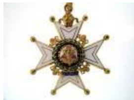
Neck decoration of Companion of the Most Excellent Order of the Bath (CB)

13.035 Full Dress, Nos 1, 2, 3 and 4 Dress. The riband with the badge attached is to be worn around the neck in the same manner as prescribed for the 2nd class.