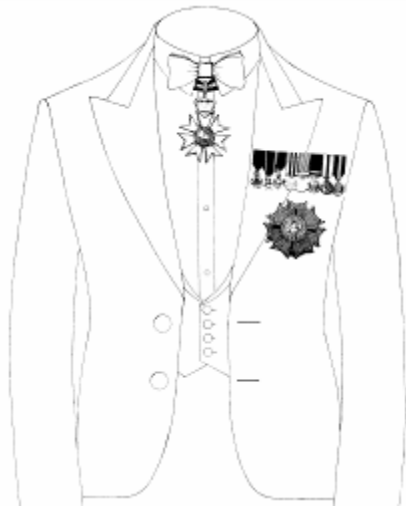
FIG 7 - Miniatures

One Star and one neck decoration which are to be the senior of each.