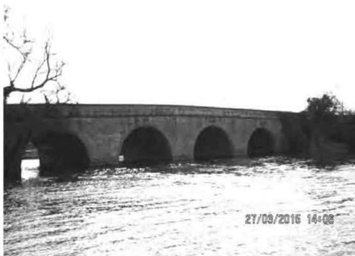
View Over Road Face