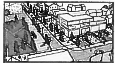
Stone Hill Park Our vision