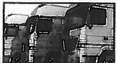
RSP's 'Fantasy Freight' plan is 'unlawful'