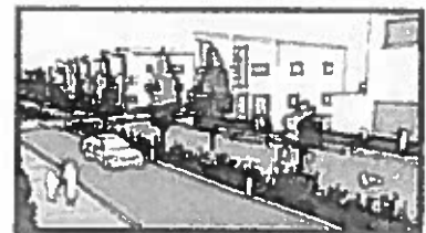
Our pledge to Thanet

Inside this update, we go into more detail about our plans. From a new country park to an improved aviation heritage component, our proposals will open a successful new chapter for Manston and a prosperous one for Thanet.