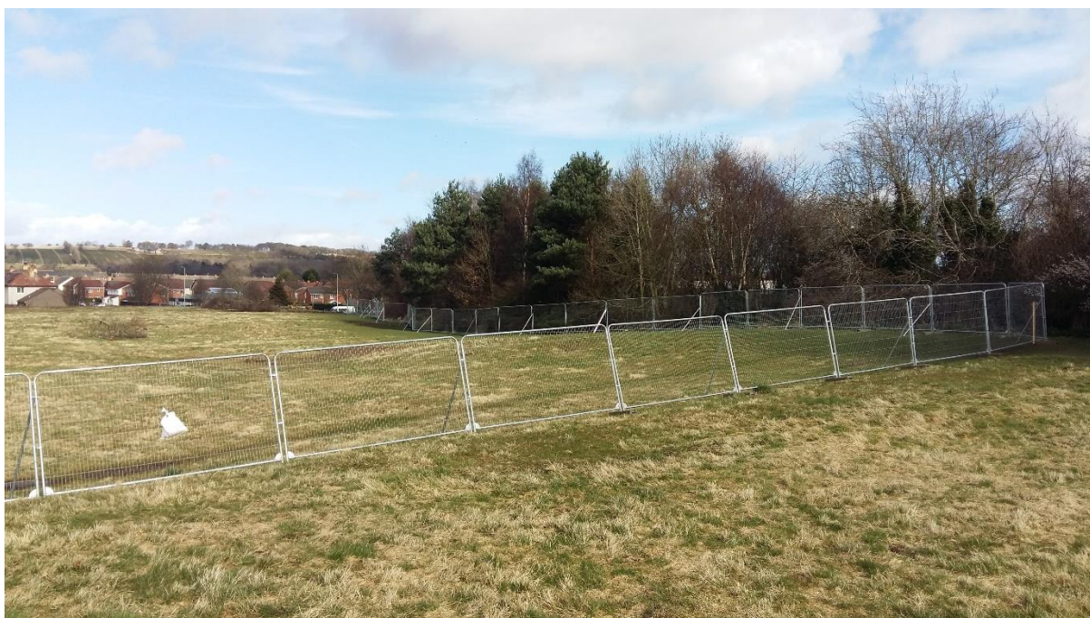
View of the eastern part of the site looking north. Protective fencing in around the trees and the site boundary.