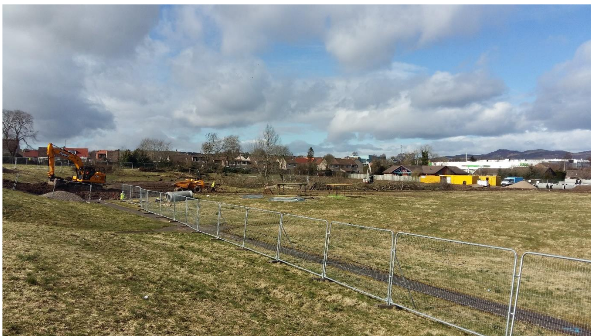
View of the site from the south looking north west. Showing the work around the trees left for breeding birds.