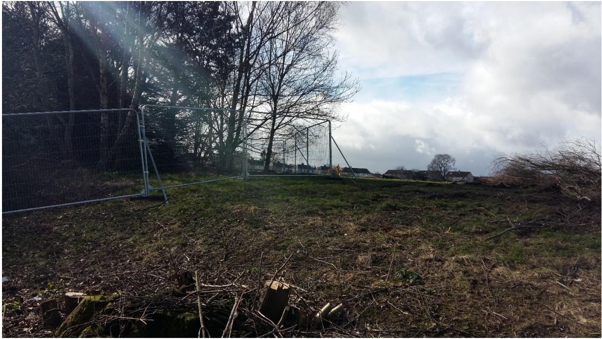
Protective fencing in place around trees on the eastern boundary of the site.