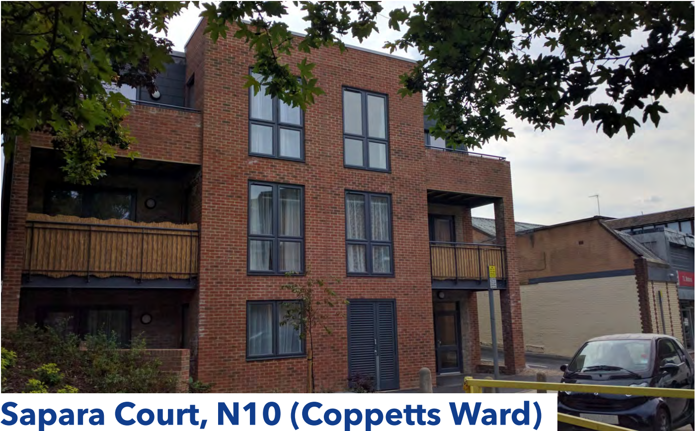
Sapara Court, N10 (Coppetts Ward)