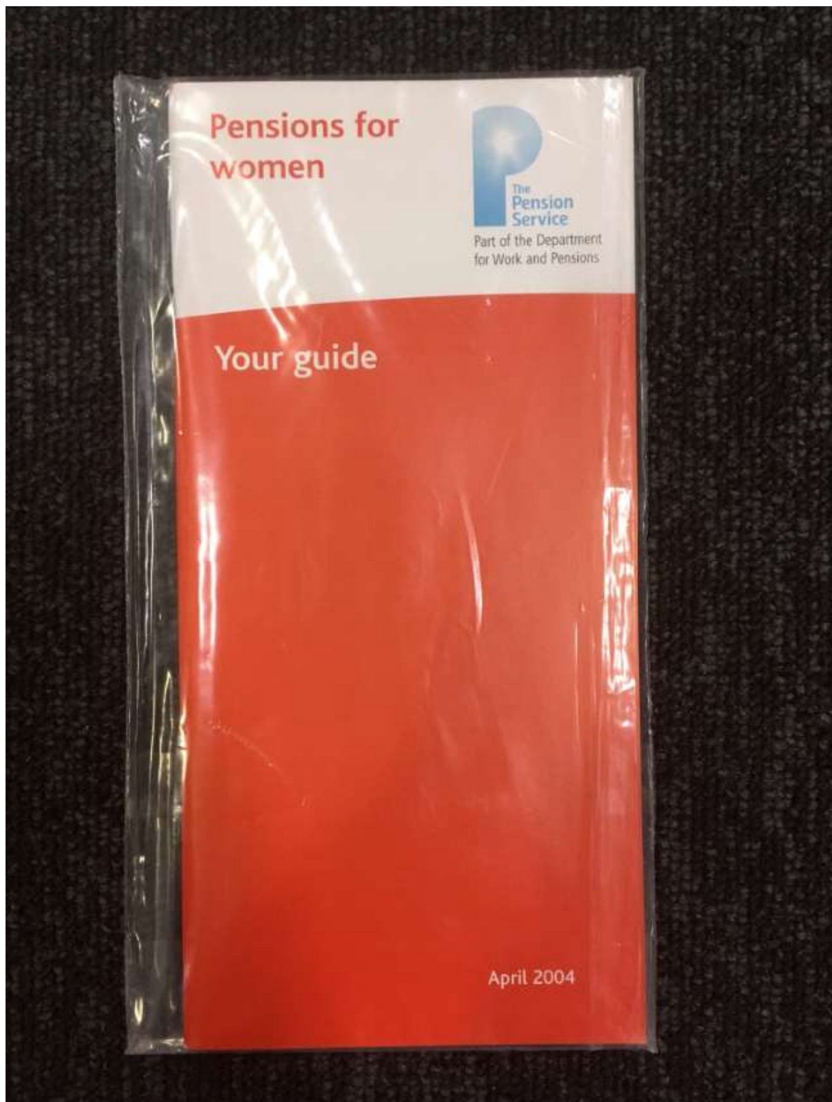
Women's Pension Pack, part of the pensions education campaign Front