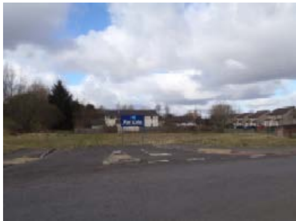
Looking west towards site from Langlea Road