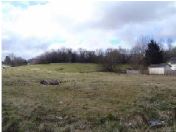
Looking south west from Langlea Avenue