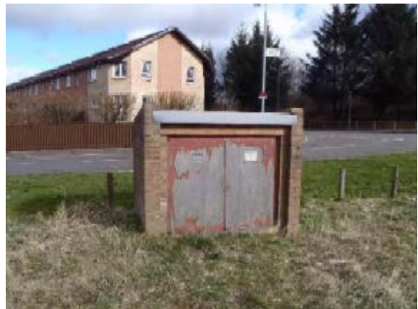
Old Sub station on corner Langlea Ave/Road