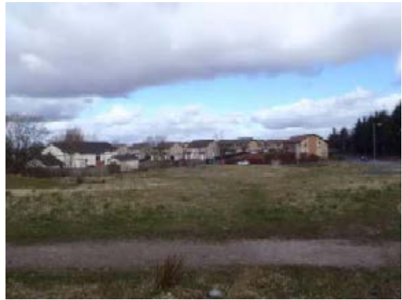
Looking towards Langlea Avenue