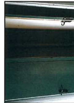
Asbestos Insulation Board Forming the Dividing Panel to the Cupboard To Remove