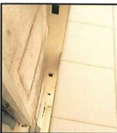
Nail Fixed Asbestos Insulation Board Forming the Ceiling Panels To Remove