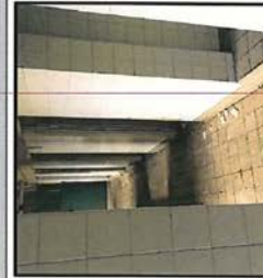
Typical Layout Ground 1 st and 2 nd Floor Wash Rooms

9mtrs x 2.5mtrs = 45m 3 + Airlock 6m 3 = 51m 3 x 10 = 510m 3