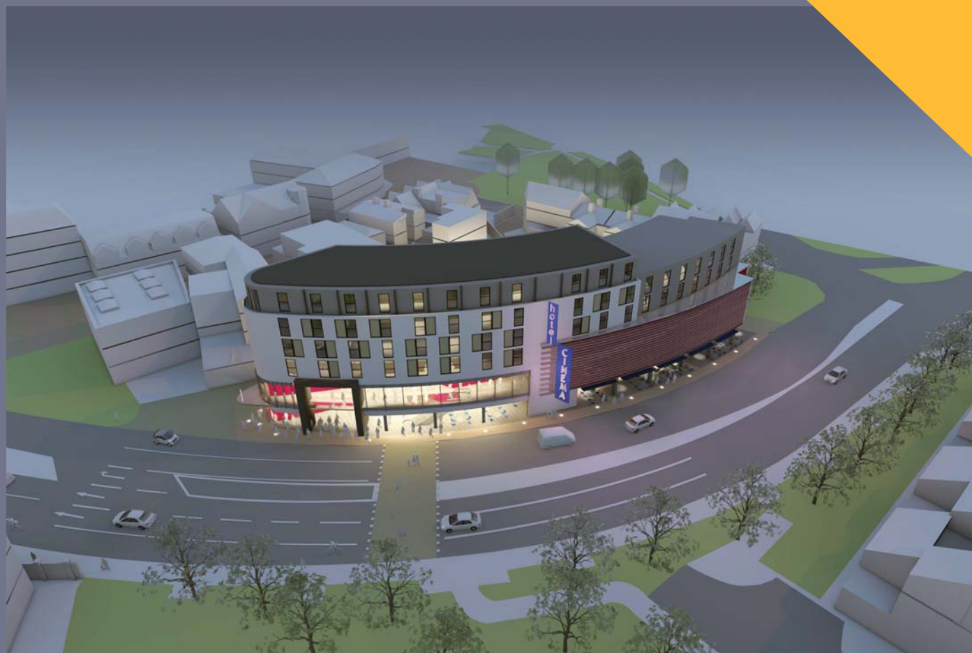
PROPOSED AERIAL VIEW FROM SOUTHWEST