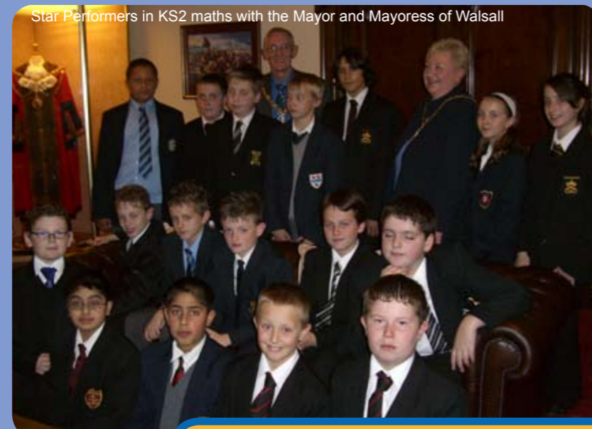
Star Performers in KS2 maths with the Mayor and Mayoress of Walsall