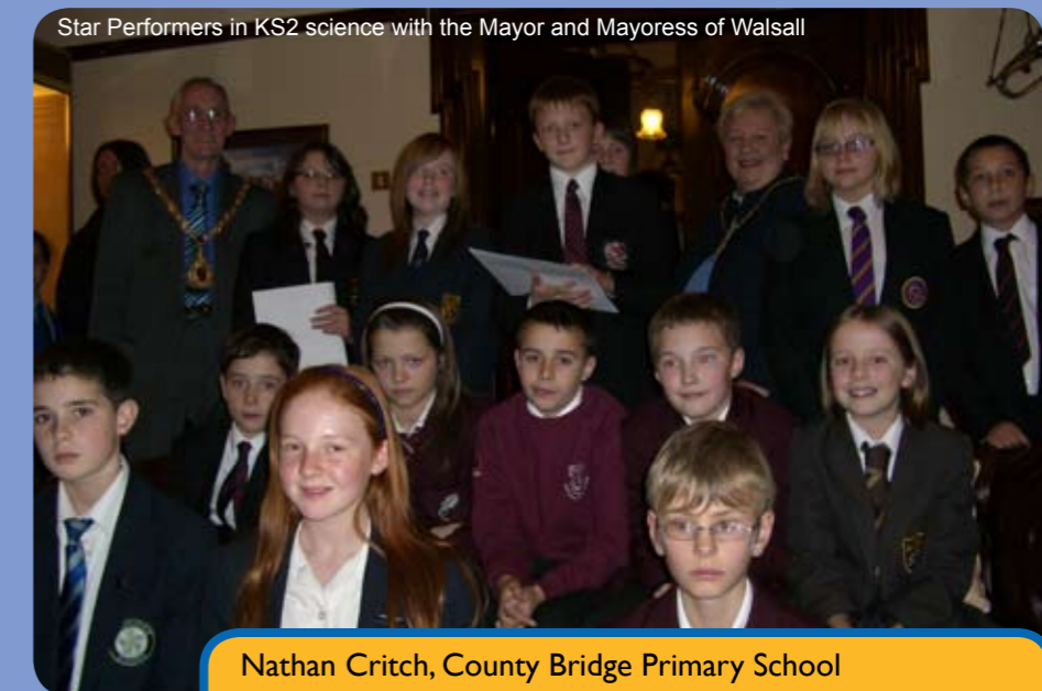
Star Performers in KS2 science with the Mayor and Mayoress of Walsall