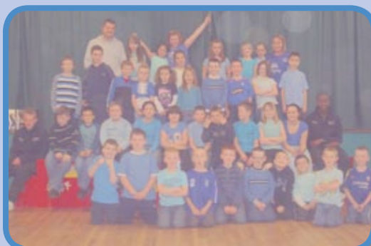
Staff and pupils at Harden Primary School supporting Blue Friday!

Blue Friday! Almost all the pupils and staff came to school in something blue - one boy even dyed his hair blue! Blue Friday is fantastic because it gets some people to do something for anti-bullying. In our school we will carry on doing things for anti-bullying all the time.