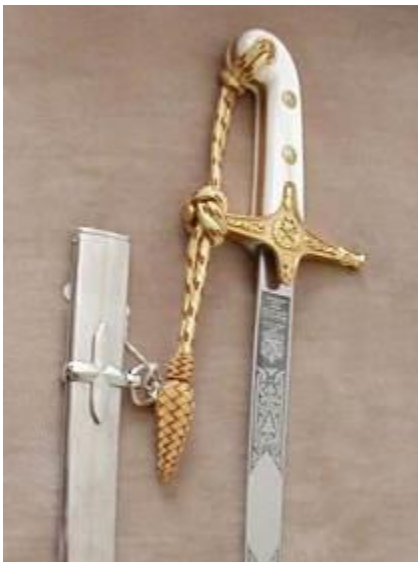
General Officer's Mameluke Sword

04.111. Sword Knot and Slings. The sword knot for General Officers of gold and crimson cord with acorn is formed into a figure of eight knot around the quillon of the Mameluke sword. When General Officers are in No. 2 Dress, the leather sword knot is wound around the basket of the Infantry pattern sword. Colonels and Brigadiers wear the sword knot hanging loose in all orders of dress