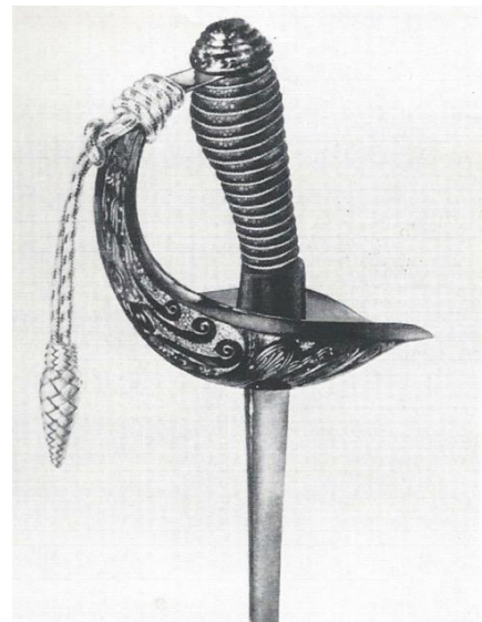
Brig/Col's Sword All order of dress