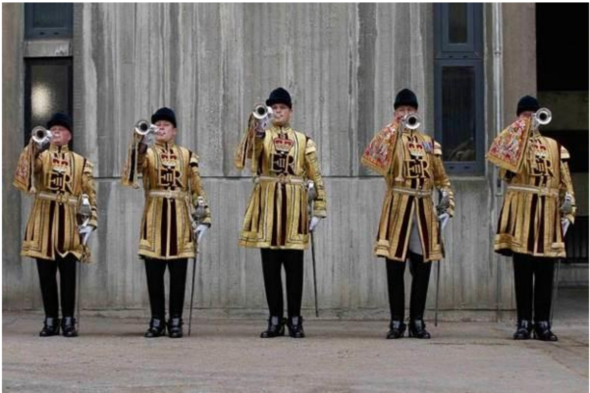
Dismounted musicians of the Band of the Household Cavalry wearing State Dress