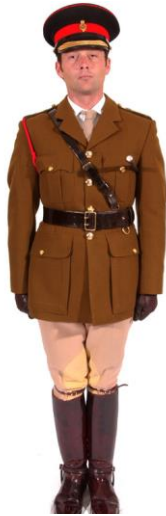
LG - No 2 Dress Mounted