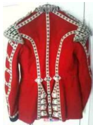
- GREN GDS Drummer's Tunic

The back is cut with side bodies and is trimmed with \frac{3}{4} inch Drummers Lace down the centre back and continuing to the bottom of the skirt, covering the side body and side skirt seam. and a row at each side running from a point slightly behind the neck point to midway between the shoulder point and hindarm pitch at the back. The back skirt has a scalloped slash each side which is trimmed with lace arranged in regimental blocks with a large regimental button plugged through each. Three squares of lace are laid on the waist seam at the top of the back skirt with their points in the waist seam. A button is sewn through the centre of each of the outside squares.