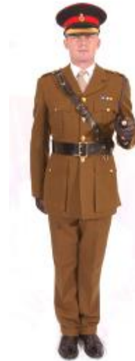
RHG/D - No 2 Dress Dismounted Non-