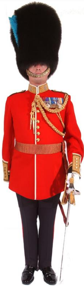
Guard of Honour Order