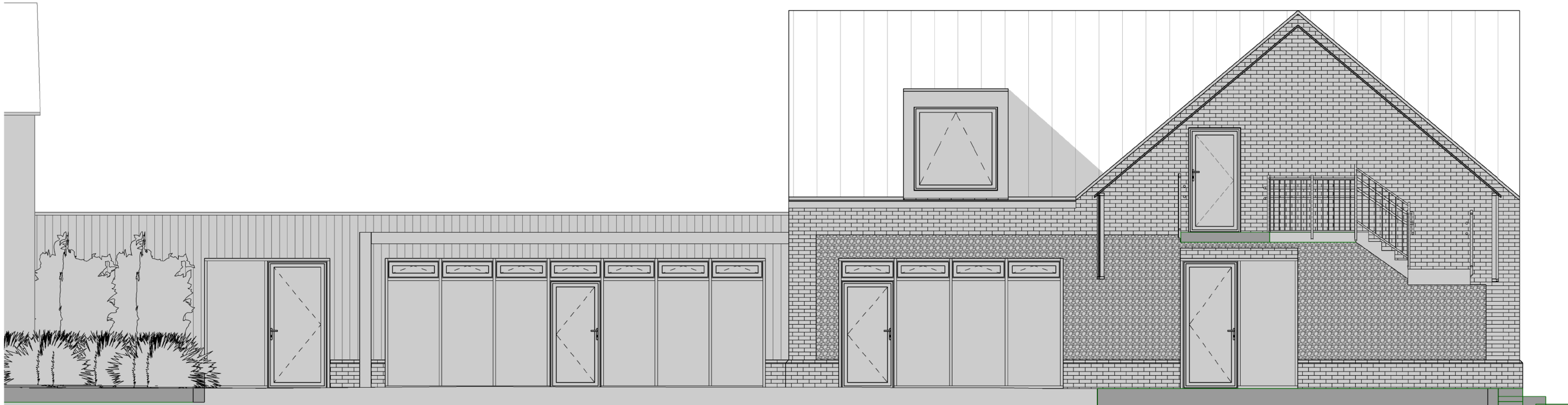
1 Building 2 North Elevation 1 : 50