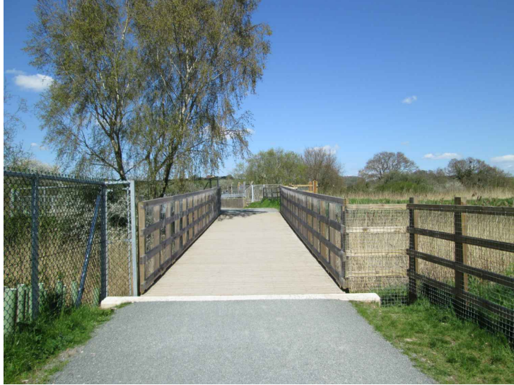
Newton Abbot - CTS structures