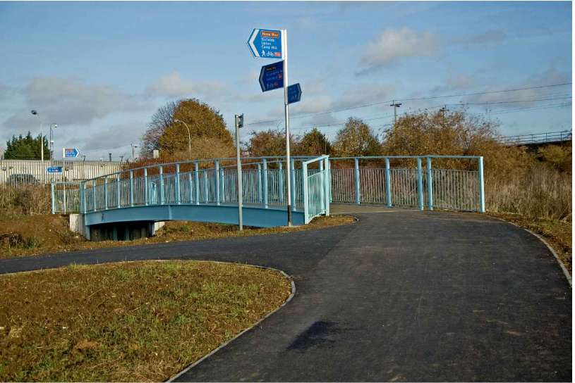
Northampton - NCC bespoke