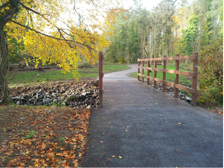
Newtonabbey NI - Sarum Hardwoods