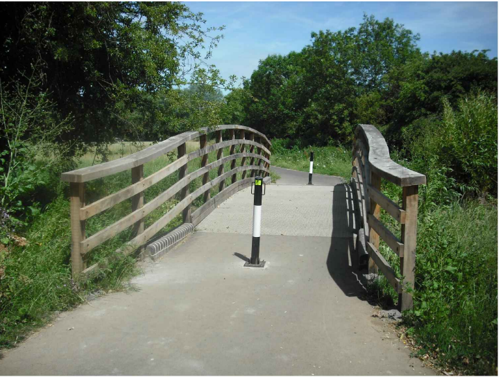
Leicester Watermead Park - LCC