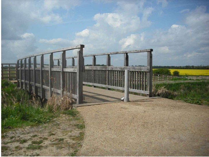
Swaffham Bulbeck - Mott Macdonald