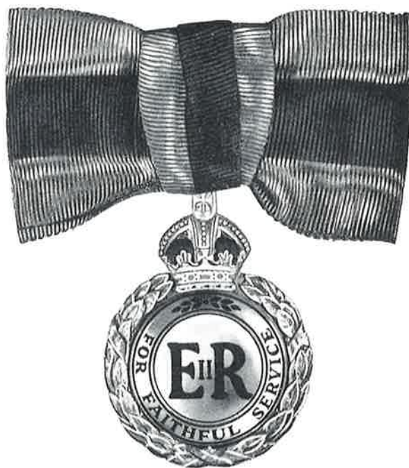
BADGE OF COMPANION (LADY)