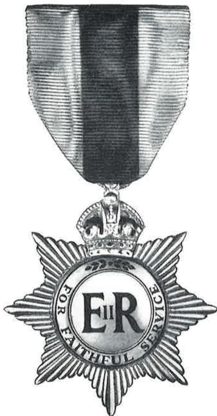
BADGE OF COMPANION