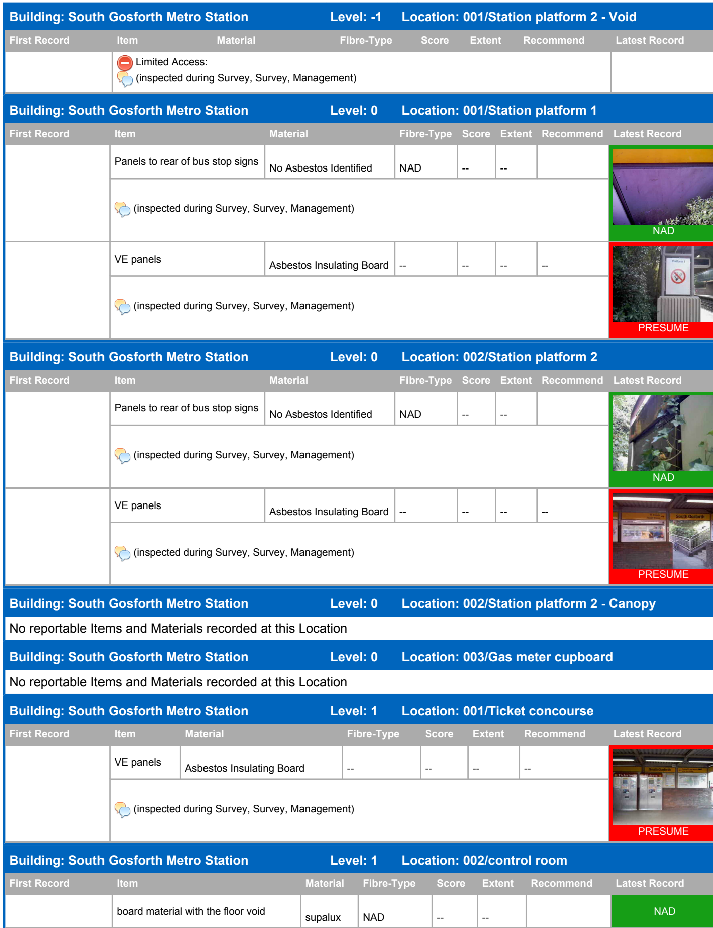
table continued from previous page...