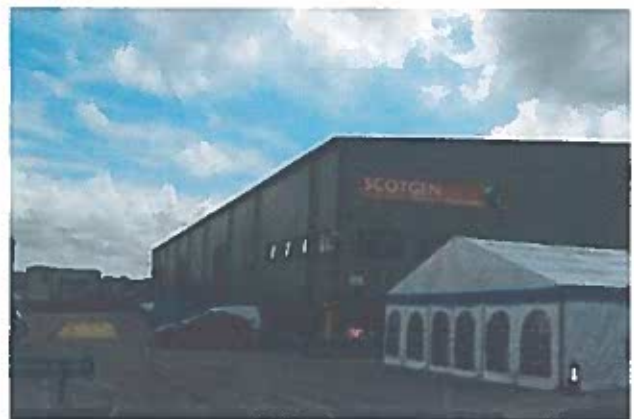
The former Scotgen incinerator facility in Dargavel, near Dumfries, pictured in 2009

There is also an "environmental justice issue", according to the report, as often those living close to incineration facilities are low income families and immigrants who face an "unavoidable allocation of health and environmental risks".