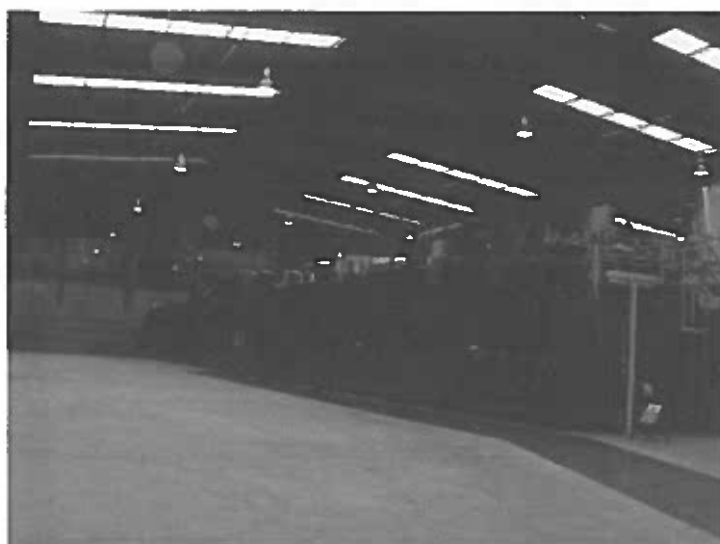
Inside the former Scotgen incinerator facility in Dargavel, near Dumfries, pictured in 2008

The report found there were hundreds of breaches of various EU emissions limits at the Dumfries EfW plant between 2009 until 2013, when its licence was revoked by the Scottish Environmental Protection Agency (SEPA).