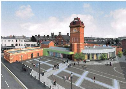
Aerial View from South West