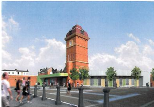
View from Public Square