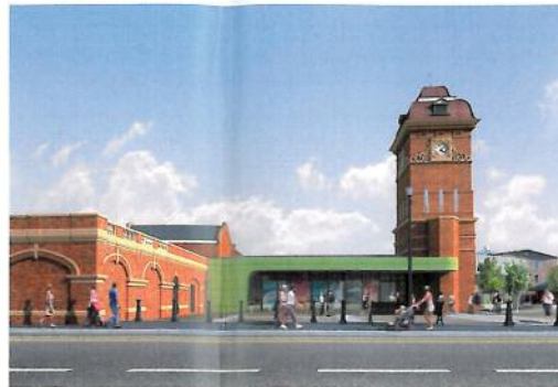
View of Main Entrance