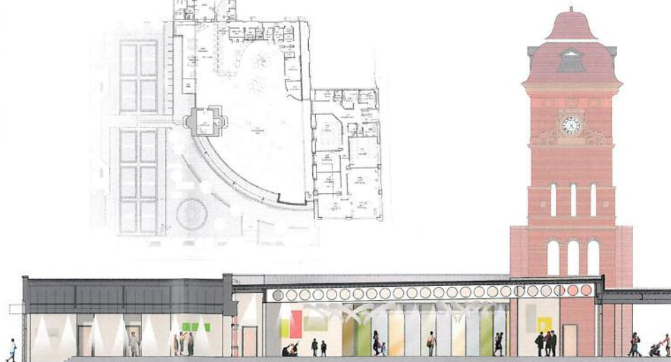
Section through Local Service Centre