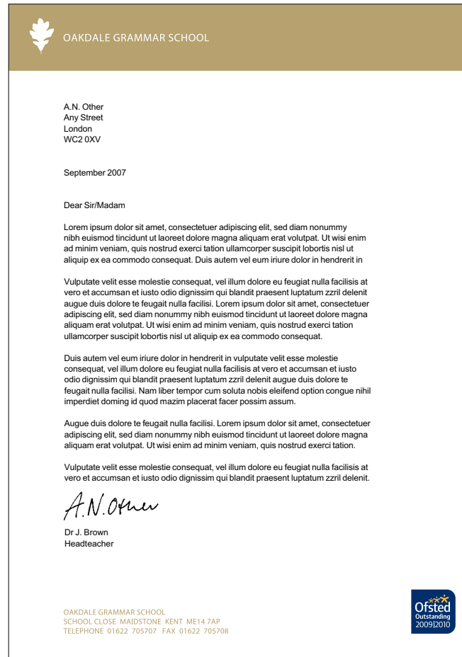
Example of school letterhead with logo applied

The Outstanding logo should be used no smaller than the minimum size of 20mm and should always adhere to the 'clear space rule' (refer to Page 5 – Size and clear space).