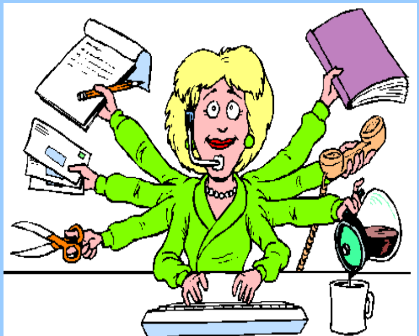
A clerk, yesterday

Having established a nationally agreed job description and person specification, the DfES has launched a National Training Programme for Clerks. The main purpose of the training programme is to enable clerks to develop the competences necessary to provide a full clerking service for their governing body and for experienced clerks to refresh, consolidate and further develop their competences. A two-part course based on the national programme is offered in March (see page 11 for details).