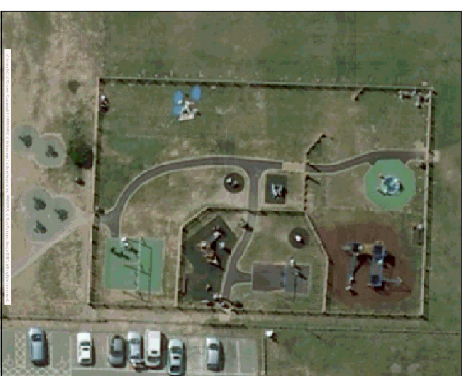
Lion's Den - Existing Play Provision